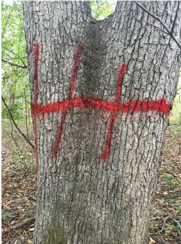
Figure 2: This is an example of the red marked tree with vertical lines which means DO NOT CUT .

The bid price does include the rights to residual logs or tops less than 9 inches D. I. B. small end remaining after the logs are cut but must be removed by the termination date of the contract. Contract termination date is the same for any residuals.